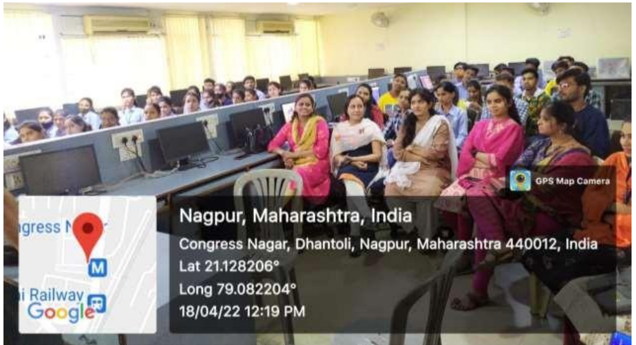
PG Students & Staff of Computer Science Department